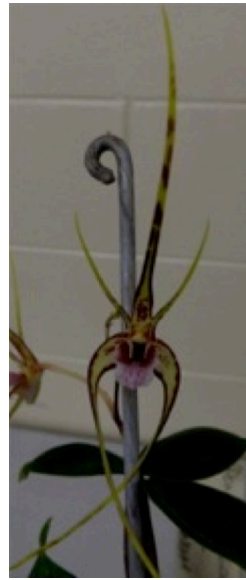
SPECIES Den tetragonium 79pts B Figuera